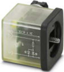
Valve connector, 3-pos., type A, 1 LED, with protective circuit, screw connection, cable screw connection M16

Please be informed that the data shown in this PDF Document is generated from our Online Catalog. Please find the complete data in the user's documentation. Our General Terms of Use for Downloads are valid ( http://download.phoenixcontact.com )