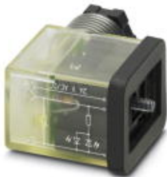
Valve connector, 3-pos., construction B, 1 LED, with protective circuit, screw connection, M16 cable gland

Please be informed that the data shown in this PDF Document is generated from our Online Catalog. Please find the complete data in the user's documentation. Our General Terms of Use for Downloads are valid ( http://download.phoenixcontact.com )