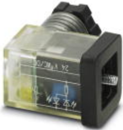
Valve connector, 3-pos., construction CI, 1 LED, with protective circuit, screw connection, M12 cable gland

Please be informed that the data shown in this PDF Document is generated from our Online Catalog. Please find the complete data in the user's documentation. Our General Terms of Use for Downloads are valid ( http://download.phoenixcontact.com )