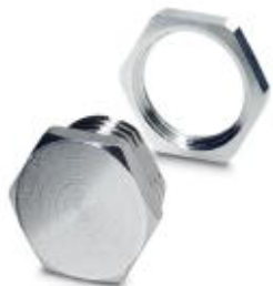
M16 screw plug for unused M12 housing cutouts

Please be informed that the data shown in this PDF Document is generated from our Online Catalog. Please find the complete data in the user's documentation. Our General Terms of Use for Downloads are valid ( http://phoenixcontact.com/download )