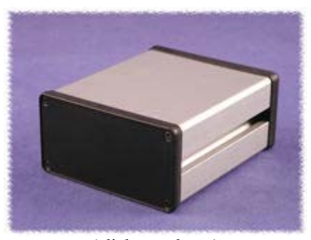
(click to enlarge)

Link here to photo tables of each part number