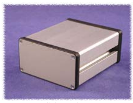
(click to enlarge)