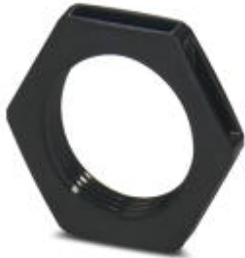
M25 nut for securing the PRC panel feed-throughs in housing, height 6.5 mm, color: black

Please be informed that the data shown in this PDF Document is generated from our Online Catalog. Please find the complete data in the user's documentation. Our General Terms of Use for Downloads are valid ( http://phoenixcontact.com/download )