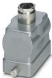
Sleeve housing, for single locking latch, height: 56 mm, with screw connection, 1 x Pg16, straight cable outlet

Please be informed that the data shown in this PDF Document is generated from our Online Catalog. Please find the complete data in the user's documentation. Our General Terms of Use for Downloads are valid ( http://phoenixcontact.com/download )