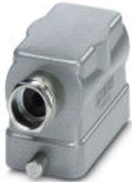
Sleeve housing, for single locking latch, height: 56 mm, with screw connection, 1 x Pg16, lateral cable outlet

Please be informed that the data shown in this PDF Document is generated from our Online Catalog. Please find the complete data in the user's documentation. Our General Terms of Use for Downloads are valid ( http://phoenixcontact.com/download )