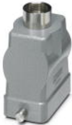
HEAVYCON sleeve housing B10, for single locking latch, height 72 mm, with support 1x M32, straight conductor exit

Please be informed that the data shown in this PDF Document is generated from our Online Catalog. Please find the complete data in the user's documentation. Our General Terms of Use for Downloads are valid ( http://download.phoenixcontact.com )