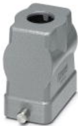
HEAVYCON B10 sleeve housing, for single locking latch, height: 72 mm, with 1 x M25 thread, straight cable outlet

Please be informed that the data shown in this PDF Document is generated from our Online Catalog. Please find the complete data in the user's documentation. Our General Terms of Use for Downloads are valid ( http://download.phoenixcontact.com )