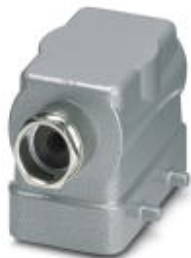
HEAVYCON B10 sleeve housing, for double locking latch, height: 56 mm, with 1 x Pg16 screw connection, lateral cable outlet

Please be informed that the data shown in this PDF Document is generated from our Online Catalog. Please find the complete data in the user's documentation. Our General Terms of Use for Downloads are valid ( http://phoenixcontact.com/download )