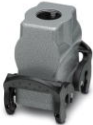
HEAVYCON B10 sleeve housing, with double locking latch, height: 56 mm, with 1 x M20 thread, straight cable outlet

Please be informed that the data shown in this PDF Document is generated from our Online Catalog. Please find the complete data in the user's documentation. Our General Terms of Use for Downloads are valid ( http://phoenixcontact.com/download )