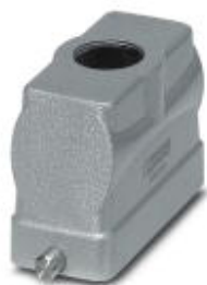
HEAVYCON B16 sleeve housing, for single locking latch, height: 65 mm, with 1 x M25 thread, straight cable outlet

Please be informed that the data shown in this PDF Document is generated from our Online Catalog. Please find the complete data in the user's documentation. Our General Terms of Use for Downloads are valid ( http://phoenixcontact.com/download )