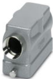
HEAVYCON B16 sleeve housing, for single locking latch, height: 65 mm, with 1 x Pg21 gland, lateral cable outlet

Please be informed that the data shown in this PDF Document is generated from our Online Catalog. Please find the complete data in the user's documentation. Our General Terms of Use for Downloads are valid ( http://phoenixcontact.com/download )