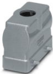
HEAVYCON B16 sleeve housing, for double locking latch, height: 65 mm, with 1 x M25 thread, straight cable outlet

Please be informed that the data shown in this PDF Document is generated from our Online Catalog. Please find the complete data in the user's documentation. Our General Terms of Use for Downloads are valid ( http://phoenixcontact.com/download )