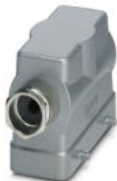
HEAVYCON B16 sleeve housing, for double locking latch, height: 76 mm, with 1 x Pg21 screw connection, lateral cable outlet

Please be informed that the data shown in this PDF Document is generated from our Online Catalog. Please find the complete data in the user's documentation. Our General Terms of Use for Downloads are valid ( http://phoenixcontact.com/download )