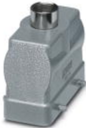
HEAVYCON B16 sleeve housing, for double locking latch, height: 76 mm, with 1 x Pg29 gland, straight cable outlet

Please be informed that the data shown in this PDF Document is generated from our Online Catalog. Please find the complete data in the user's documentation. Our General Terms of Use for Downloads are valid ( http://download.phoenixcontact.com )