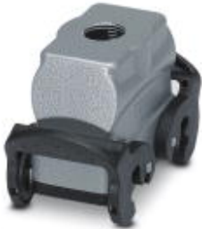
HEAVYCON B10 coupling housing, with double locking latch, height: 62 mm, with 1 x M20 thread, straight cable outlet

Please be informed that the data shown in this PDF Document is generated from our Online Catalog. Please find the complete data in the user's documentation. Our General Terms of Use for Downloads are valid ( http://phoenixcontact.com/download )