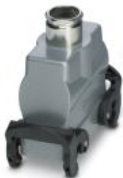
HEAVYCON B16 sleeve housing, with double locking latch, height: 72 mm, with 1 x Pg21 screw connection, straight cable outlet

Please be informed that the data shown in this PDF Document is generated from our Online Catalog. Please find the complete data in the user's documentation. Our General Terms of Use for Downloads are valid ( http://phoenixcontact.com/download )