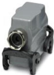
HEAVYCON B16 sleeve housing, with double locking latch, height 72 mm, with screw connection 1 x Pg29, lateral cable outlet

Please be informed that the data shown in this PDF Document is generated from our Online Catalog. Please find the complete data in the user's documentation. Our General Terms of Use for Downloads are valid ( http://download.phoenixcontact.com )