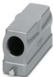
HEAVYCON B24 sleeve housing, for single locking latch, height: 65 mm, with 1 x M25 thread, lateral cable outlet

Please be informed that the data shown in this PDF Document is generated from our Online Catalog. Please find the complete data in the user's documentation. Our General Terms of Use for Downloads are valid ( http://phoenixcontact.com/download )