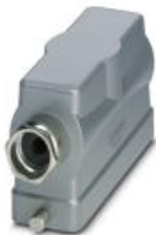
HEAVYCON B24 sleeve housing, for single locking latch, height: 76 mm, with 1 x Pg29 screw connection, lateral cable outlet

Please be informed that the data shown in this PDF Document is generated from our Online Catalog. Please find the complete data in the user's documentation. Our General Terms of Use for Downloads are valid ( http://phoenixcontact.com/download )