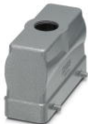
HEAVYCON B24 sleeve housing, for double locking latch, height: 65 mm, with 1 x M32 thread, straight cable outlet

Please be informed that the data shown in this PDF Document is generated from our Online Catalog. Please find the complete data in the user's documentation. Our General Terms of Use for Downloads are valid ( http://phoenixcontact.com/download )