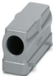
HEAVYCON B24 sleeve housing, for double locking latch, height: 65 mm, with 1 x M32 thread, lateral cable outlet

Please be informed that the data shown in this PDF Document is generated from our Online Catalog. Please find the complete data in the user's documentation. Our General Terms of Use for Downloads are valid ( http://phoenixcontact.com/download )