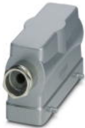
HEAVYCON B24 sleeve housing, for double locking latch, height: 76 mm, with 1 x Pg29 screw connection, lateral cable outlet

Please be informed that the data shown in this PDF Document is generated from our Online Catalog. Please find the complete data in the user's documentation. Our General Terms of Use for Downloads are valid ( http://phoenixcontact.com/download )