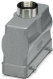
HEAVYCON sleeve housing B24, for double locking latch, height 76 mm, with support 1x M25, straight conductor exit

Please be informed that the data shown in this PDF Document is generated from our Online Catalog. Please find the complete data in the user's documentation. Our General Terms of Use for Downloads are valid ( http://download.phoenixcontact.com )