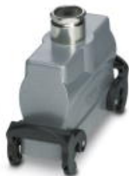
HEAVYCON B24 sleeve housing, with double locking latch, height: 72 mm, with 1 x Pg21 screw connection, straight cable outlet

Please be informed that the data shown in this PDF Document is generated from our Online Catalog. Please find the complete data in the user's documentation. Our General Terms of Use for Downloads are valid ( http://phoenixcontact.com/download )