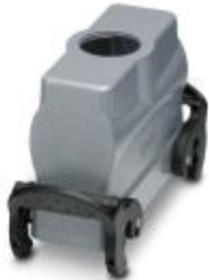
HEAVYCON B24 sleeve housing, with double locking latch, height: 72 mm, with 1 x M32 thread, straight cable outlet

Please be informed that the data shown in this PDF Document is generated from our Online Catalog. Please find the complete data in the user's documentation. Our General Terms of Use for Downloads are valid ( http://phoenixcontact.com/download )