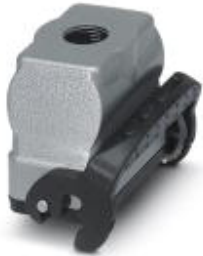
HEAVYCON B6 coupling housing, with single locking latch, height: 77.5 mm, with 1 x M25 thread, straight cable outlet

Please be informed that the data shown in this PDF Document is generated from our Online Catalog. Please find the complete data in the user's documentation. Our General Terms of Use for Downloads are valid ( http://phoenixcontact.com/download )