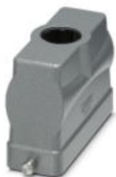
HEAVYCON B24 sleeve housing, for single locking latch, height: 65 mm, with 1 x M32 thread, straight cable outlet

Please be informed that the data shown in this PDF Document is generated from our Online Catalog. Please find the complete data in the user's documentation. Our General Terms of Use for Downloads are valid ( http://phoenixcontact.com/download )