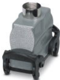
HEAVYCON B16 coupling housing, with double locking latch, height: 82 mm, with 1 x Pg21 gland, straight cable outlet

Please be informed that the data shown in this PDF Document is generated from our Online Catalog. Please find the complete data in the user's documentation. Our General Terms of Use for Downloads are valid ( http://download.phoenixcontact.com )