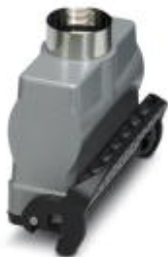
HEAVYCON B24 coupling housing, with single locking latch, height: 80.5 mm, with 1 x M32 gland, straight cable outlet

Please be informed that the data shown in this PDF Document is generated from our Online Catalog. Please find the complete data in the user's documentation. Our General Terms of Use for Downloads are valid ( http://download.phoenixcontact.com )