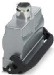
HEAVYCON B24 coupling housing, with double locking latch, height: 81.5 mm, with 1 x Pg21 screw connection, straight cable outlet

Please be informed that the data shown in this PDF Document is generated from our Online Catalog. Please find the complete data in the user's documentation. Our General Terms of Use for Downloads are valid ( http://download.phoenixcontact.com )