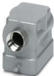
HEAVYCON B6 sleeve housing, for single locking latch, height: 56 mm, with 1 x Pg13.5 gland, lateral cable outlet

Please be informed that the data shown in this PDF Document is generated from our Online Catalog. Please find the complete data in the user's documentation. Our General Terms of Use for Downloads are valid ( http://phoenixcontact.com/download )