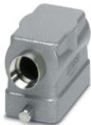
HEAVYCON B6 sleeve housing, for single locking latch, height: 56 mm, with 1 x Pg16 gland, lateral cable outlet

Please be informed that the data shown in this PDF Document is generated from our Online Catalog. Please find the complete data in the user's documentation. Our General Terms of Use for Downloads are valid ( http://phoenixcontact.com/download )