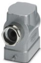
HEAVYCON B6 sleeve housing, for single locking latch, height: 72 mm, with 1 x Pg21 screw connection, lateral cable outlet

Please be informed that the data shown in this PDF Document is generated from our Online Catalog. Please find the complete data in the user's documentation. Our General Terms of Use for Downloads are valid ( http://phoenixcontact.com/download )