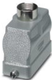
HEAVYCON sleeve housing B6, for single locking latch, height 72 mm, with support 1x M25, straight conductor exit

Please be informed that the data shown in this PDF Document is generated from our Online Catalog. Please find the complete data in the user's documentation. Our General Terms of Use for Downloads are valid ( http://phoenixcontact.com/download )