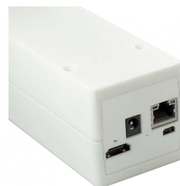
eCAM-i.MX connector view