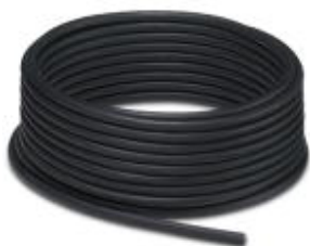
Cable ring, PUR halogen-free black, 3-pos., conductor colors: brown/blue/black, cable length: 100 m

Please be informed that the data shown in this PDF Document is generated from our Online Catalog. Please find the complete data in the user's documentation. Our General Terms of Use for Downloads are valid ( http://phoenixcontact.com/download )