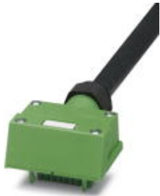
Sensor/actuator connector hood, with master cable, marking label, for an SAC box with 6 double-occupied slots

Please be informed that the data shown in this PDF Document is generated from our Online Catalog. Please find the complete data in the user's documentation. Our General Terms of Use for Downloads are valid ( http://download.phoenixcontact.com )