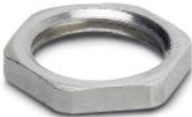
Flat nut with M16 thread

Please be informed that the data shown in this PDF Document is generated from our Online Catalog. Please find the complete data in the user's documentation. Our General Terms of Use for Downloads are valid ( http://download.phoenixcontact.com )