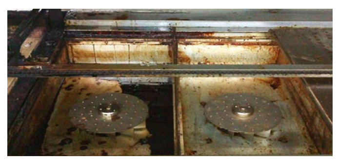
PROBLEM: Cleaning requires over 8 hours of machine downtime and man hours, with harsh chemicals, brushes and scrapers.