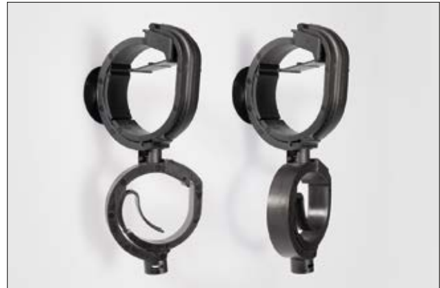
IAHC( )AH in combination with an IAHC( )T.