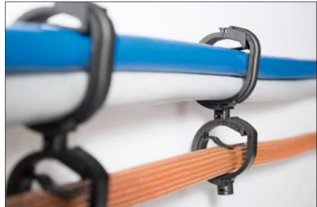
IAHC( )AH in combination with an IAHC( )T.