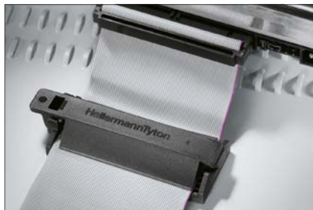
Based on extremely soft wings any flat cable is gently fastened.