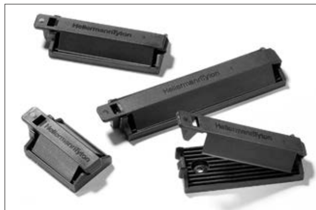
The flat ribbon cables are available in 4 different sizes.