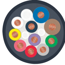
PUR/PVC black [PUR]