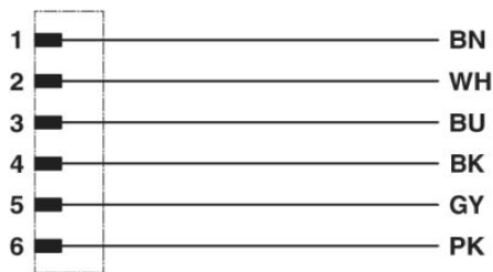
Contact assignment of the M8 plug