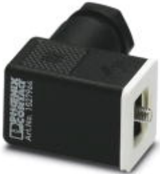
Valve connector, 3-pos., type CI, unconnected, screw connection, cable screw connection Pg7

Please be informed that the data shown in this PDF Document is generated from our Online Catalog. Please find the complete data in the user's documentation. Our General Terms of Use for Downloads are valid ( http://download.phoenixcontact.com )