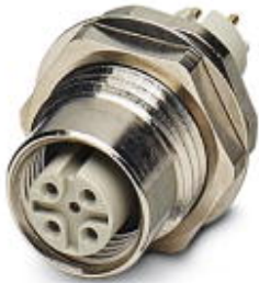
Sensor/Actuator flush-type socket, 5-pos., M12, A-coded, rear/screw mounting with Pg9 thread, with straight solder connection

Please be informed that the data shown in this PDF Document is generated from our Online Catalog. Please find the complete data in the user's documentation. Our General Terms of Use for Downloads are valid ( http://phoenixcontact.com/download )