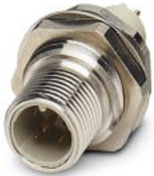
Sensor/Actuator flush-type plug, 5-pos., M12, A-coded, rear/screw mounting with Pg9 thread, with straight solder connection

Please be informed that the data shown in this PDF Document is generated from our Online Catalog. Please find the complete data in the user's documentation. Our General Terms of Use for Downloads are valid ( http://download.phoenixcontact.com )