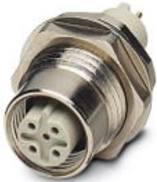
Sensor/Actuator flush-type socket, 5-pos., M12, B-coded, rear/screw mounting with Pg9 thread, with straight solder connection

Please be informed that the data shown in this PDF Document is generated from our Online Catalog. Please find the complete data in the user's documentation. Our General Terms of Use for Downloads are valid ( http://download.phoenixcontact.com )